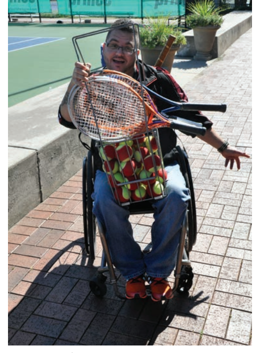
Rick's ready for spring!

Through participation in adaptive sports, participants can meet positive role models, increase socialization skills, improve